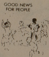
GOOD NEWS FOR PEOPLE WHO ARE REJECTED AND LONELY