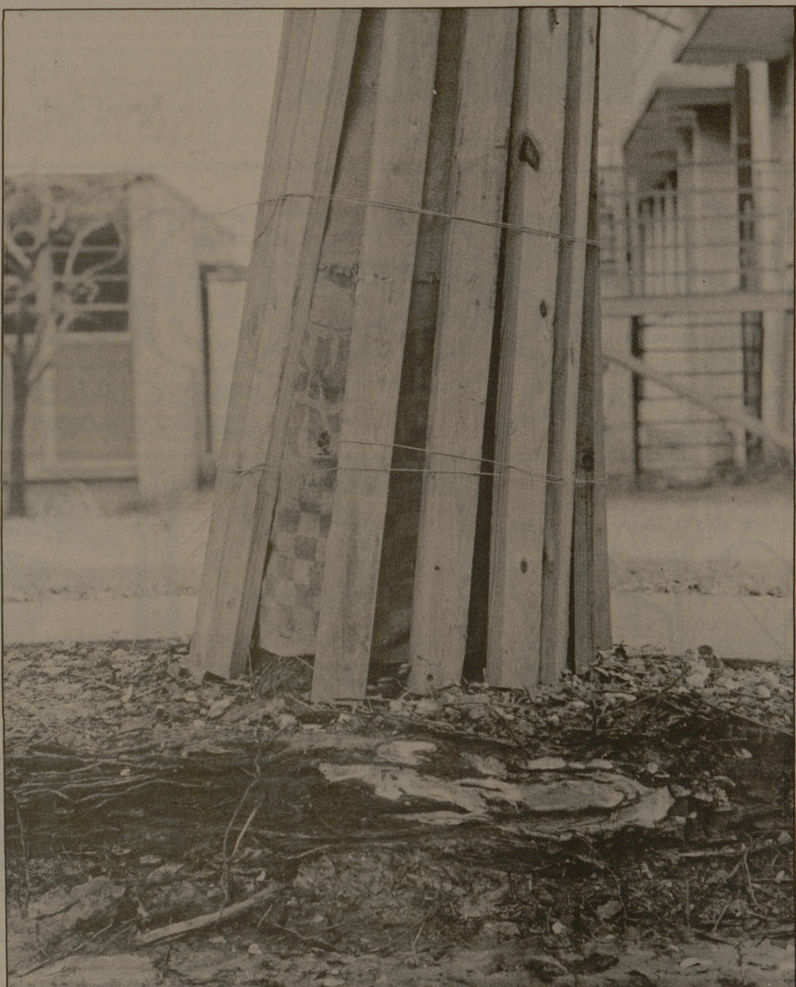
Roots scraped by bulldozer may cause trees to die.