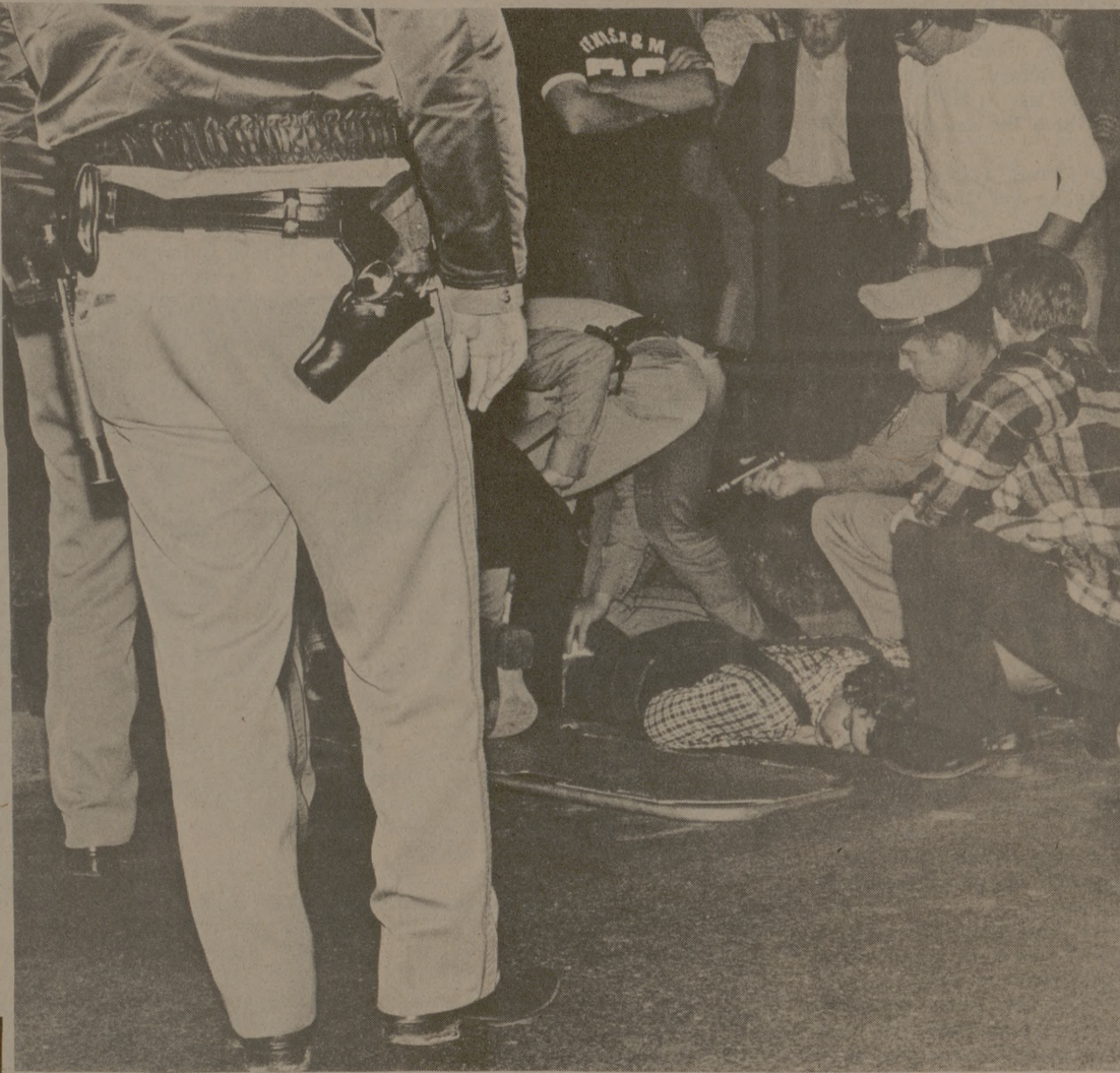
Wreck victim in serious condition

He suggested a continuation of efforts by volunteer groups. "If there's an issue that transcends all boundaries, it's the environment," he said. "It just takes the patience of Job and the wisdom of Moses."