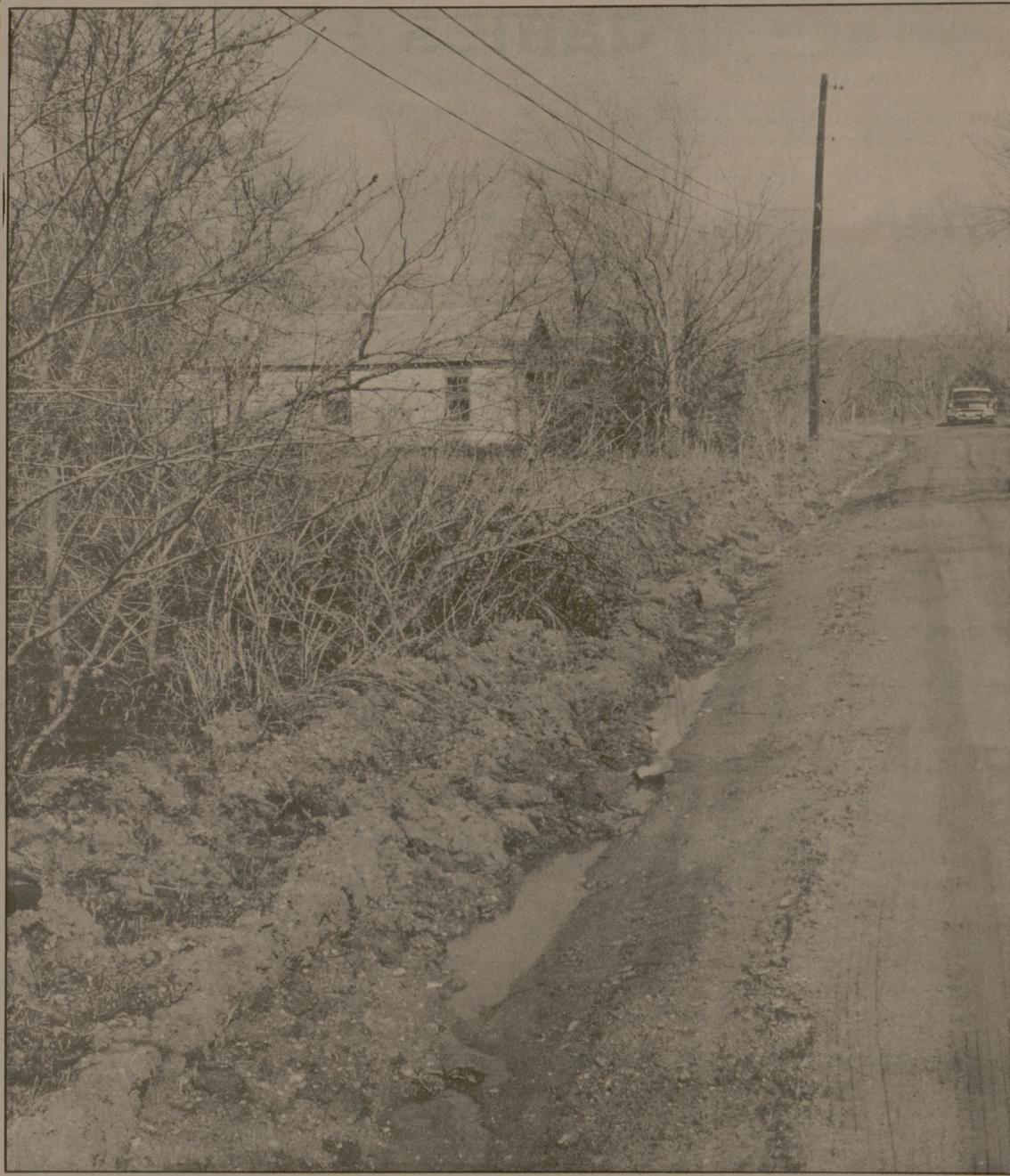
Sterling Street in neighborhood "B" selected for paving.

A second public hearing will be held Feb. 27 between the city council, citizens' advisory group and the planning and zoning commission to consider action taken by the council. On the following day the council will submit its plan to the Brazos Valley Development Council (BVDC) for review and comment.