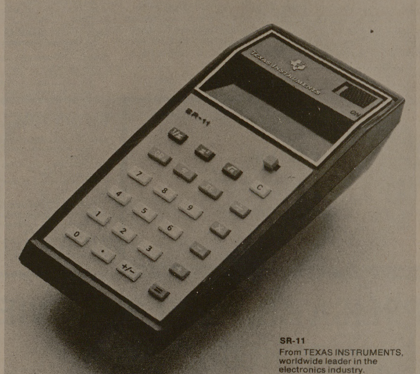
SR-11 From TEXAS INSTRUMENTS, worldwide leader in the electronics industry.

No waiting for delivery. Your University Calculator Center has the largest inventory of quality units available anywhere. Plus, we specialize in the calculator requirements of the college student.