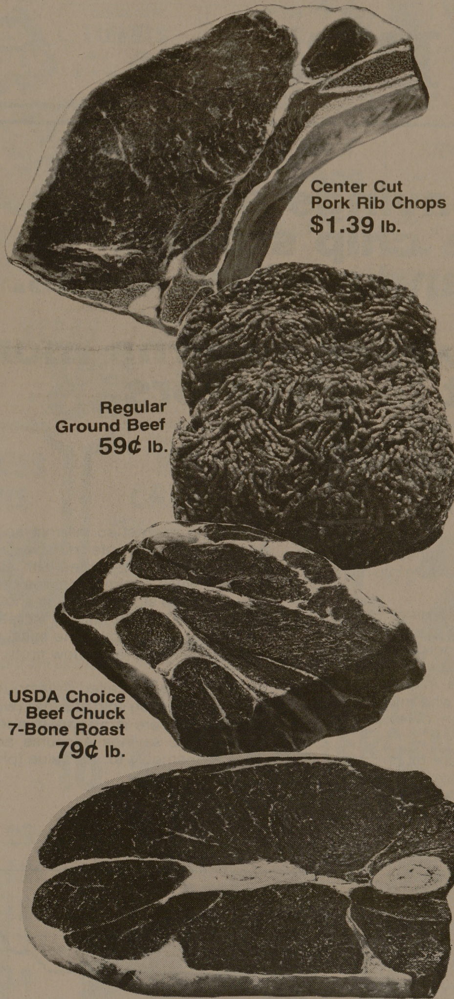
Center Cut Pork Rib Chops $1.39 lb.