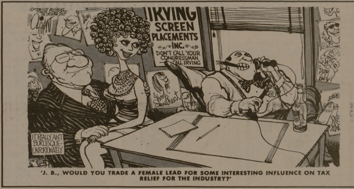
"J. B., WOULD YOU TRADE A FEMALE LEAD FOR SOME INTERESTING INFLUENCE ON TAX RELIEF FOR THE INDUSTRY?"