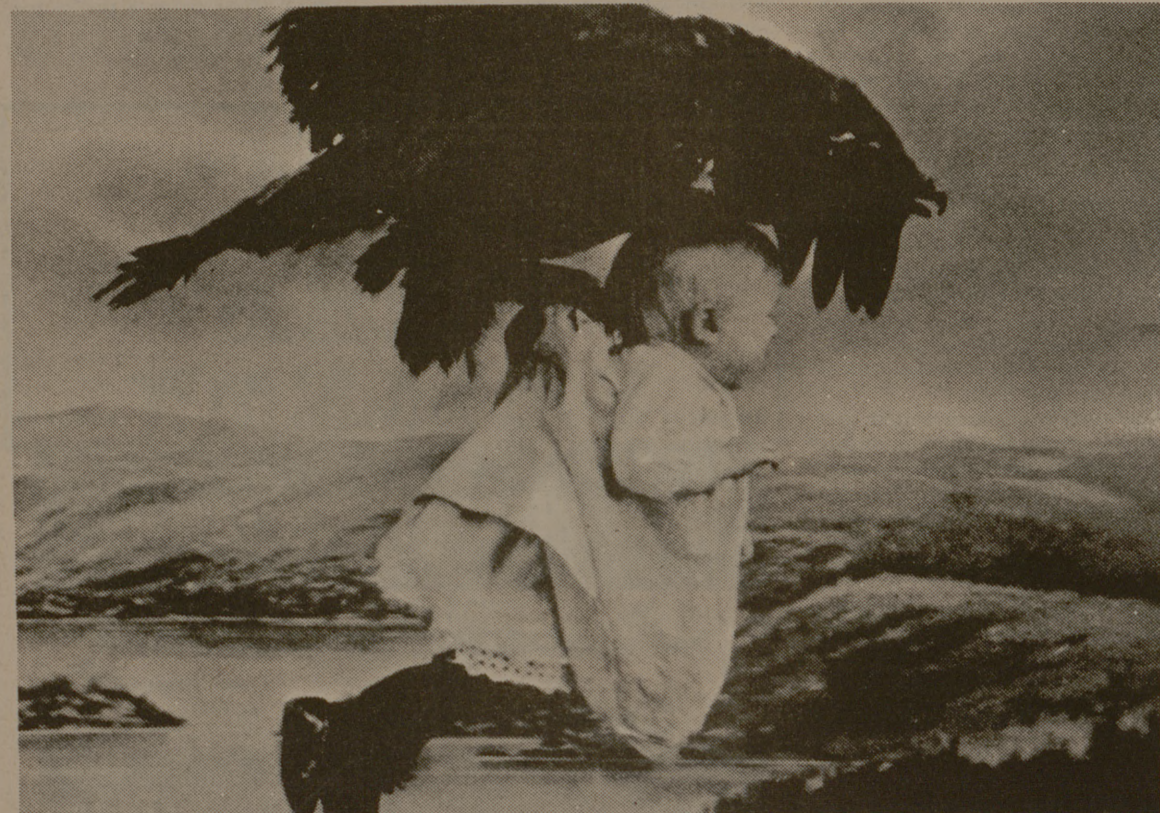
Take Texas to lunch.