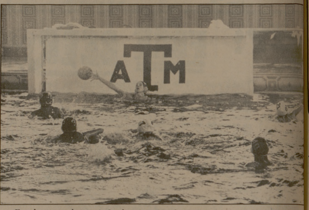
Female water polo team in Southwest tourney this past weekend.

McLellan will return with the tire squad intact next fall, loo