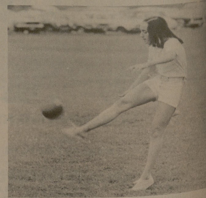
The kicking game