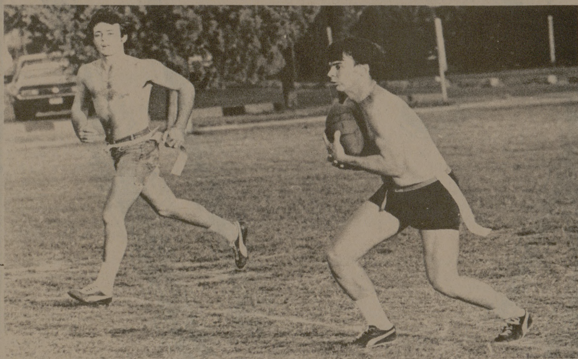
The run & pick-up the blocker game