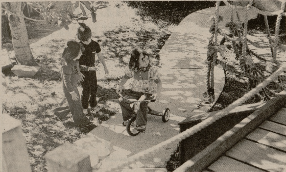
This playground in Houston was built by two Texas A&M University students