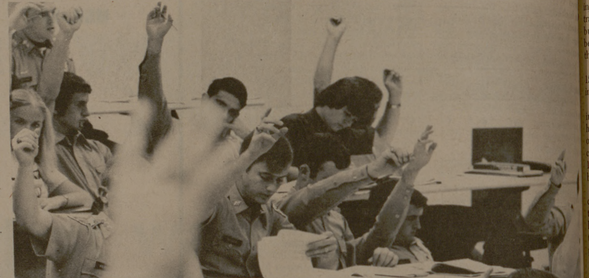
HANDS RAISE HIGH as the Student Senate votes on ticket distribution proposals at their meeting last night.

Candidates can not withdraw their names after the filing period ends.