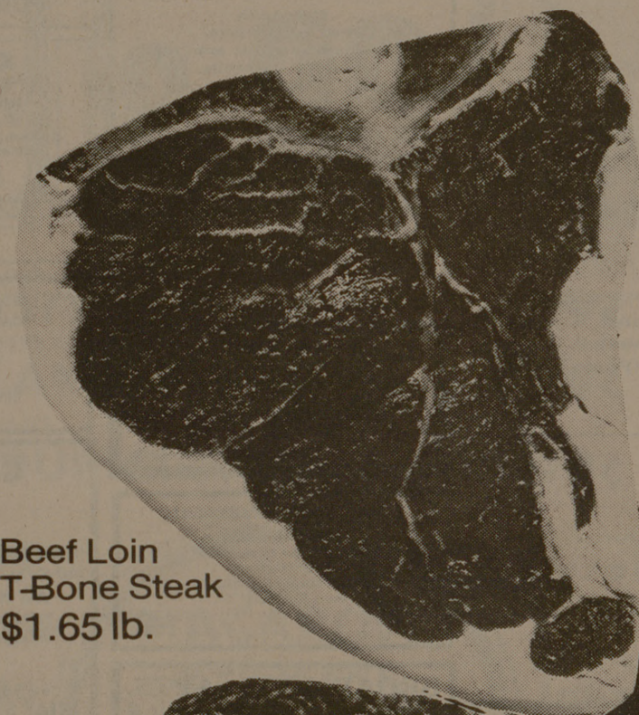
Beef Loin T-Bone Steak $1.65 lb.