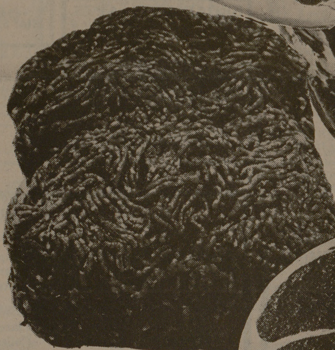
Extra Lean Ground Beef 99¢ lb.