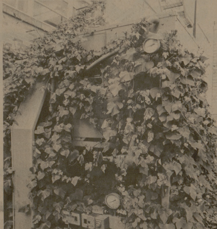
This condenser, with gauges and buttons peeking out, makes a hefty latticework for the vines that have heavily entangled it on campus.

Most dealers reported little difficulty getting inexpensive guns, but the demand is for mid-priced and quality firearms and they are in short supply.