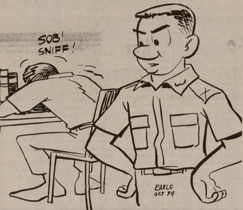
"We promised to not talk about the Kansas game, and that applies to crying about it too!"