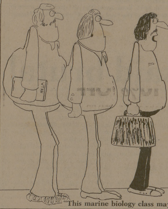
"This marine biology class may not be so dull after all . . ."