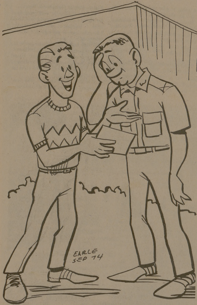
"It's the greatest schedule I've ever had! But it is going to be difficult with three classes meeting at the same hour!"