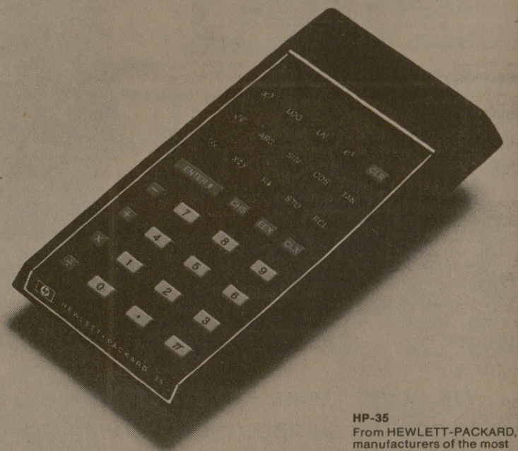
HP-35 From HEWLETT-PACKARD, manufacturers of the most advanced, quality calculators in the industry.

No waiting for delivery. Your University Calculator Center has the largest inventory of quality units available anywhere. Plus, we specialize in the calculator requirements of the college student.