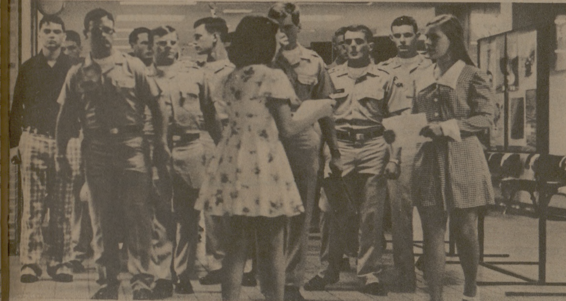
UNIVERSITY CENTER TOURS acquainted new students with the MSC at Freshman Open House Saturday night. The open house showed students the building and the various organizations at TAMU.