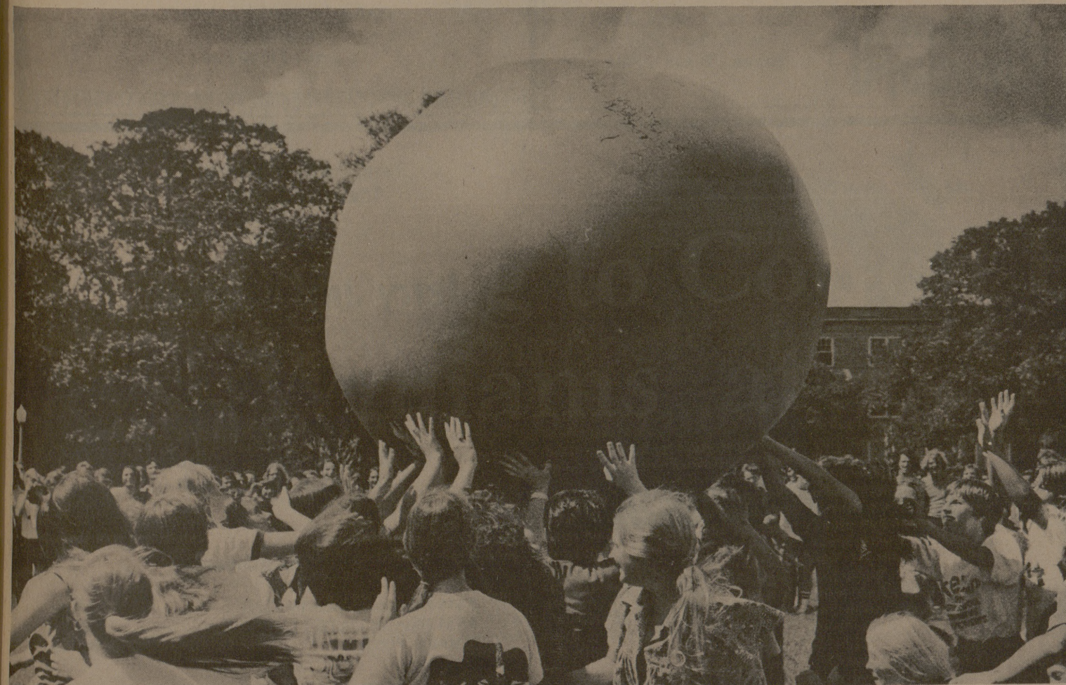
THE BIG PUSH was needed Saturday to win the annual pushball contest. The contest took place on the drill field and dorms, both men's and women's, competed against each other.