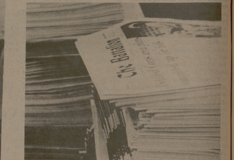
.....the final product, printed from offset plates which are made from photographs of the paste ups.