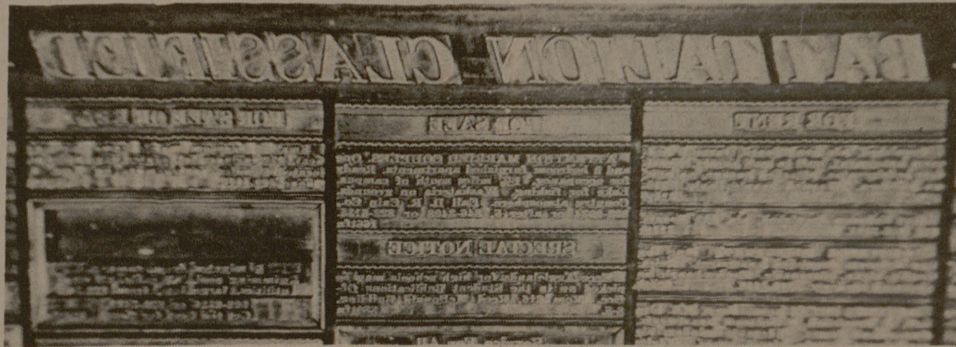
A page of hot type (above).