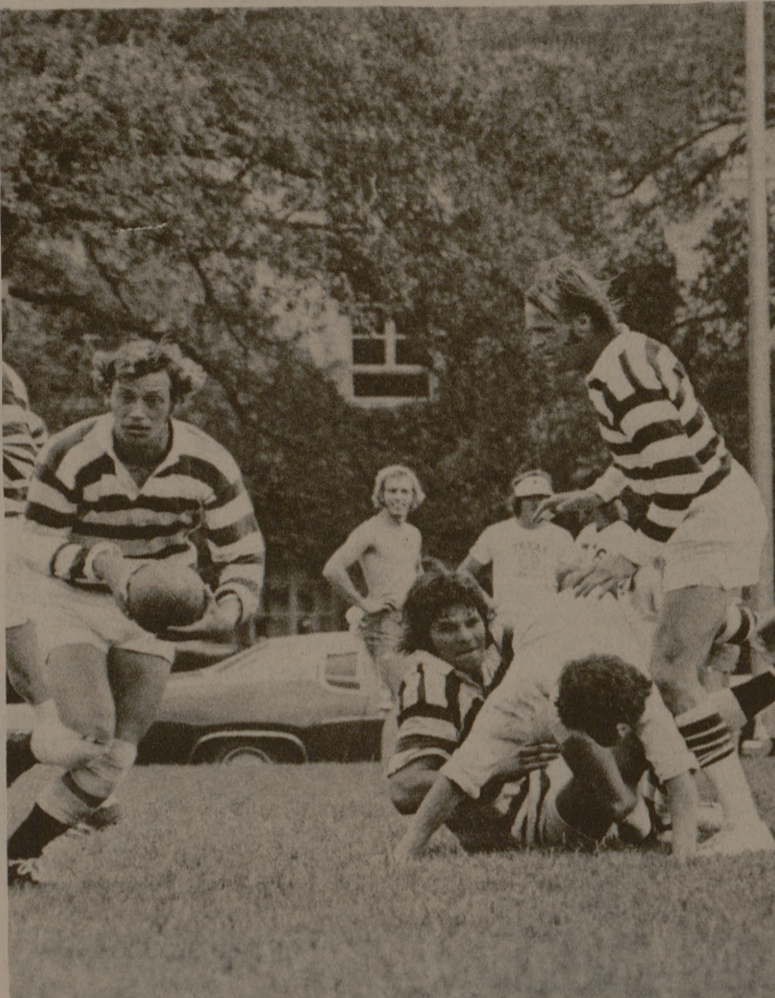
FOUR IN A ROW —Aggie rugby team held off a strong rally from the Houston Old Boys to post a 15-13 win and their fourth straight state title. The Ags are currently the national rugby champions.