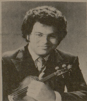
Exclusive Management, Hurok Concerts, Inc.

The Opera and Performing Arts Society presents ITZHAK PERLMAN, VIOLINIST