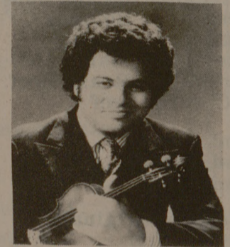
Exclusive Management, Hurok Concerts, Inc.