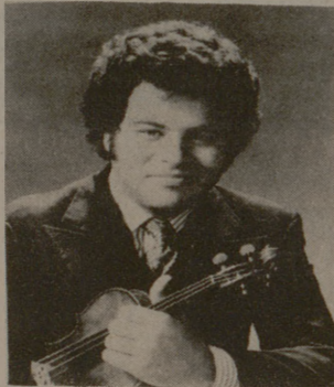
Exclusive Management, Hurok Concerts, Inc.

The Opera and Performing Arts Society presents ITZHAK PERLMAN, VIOLINIST