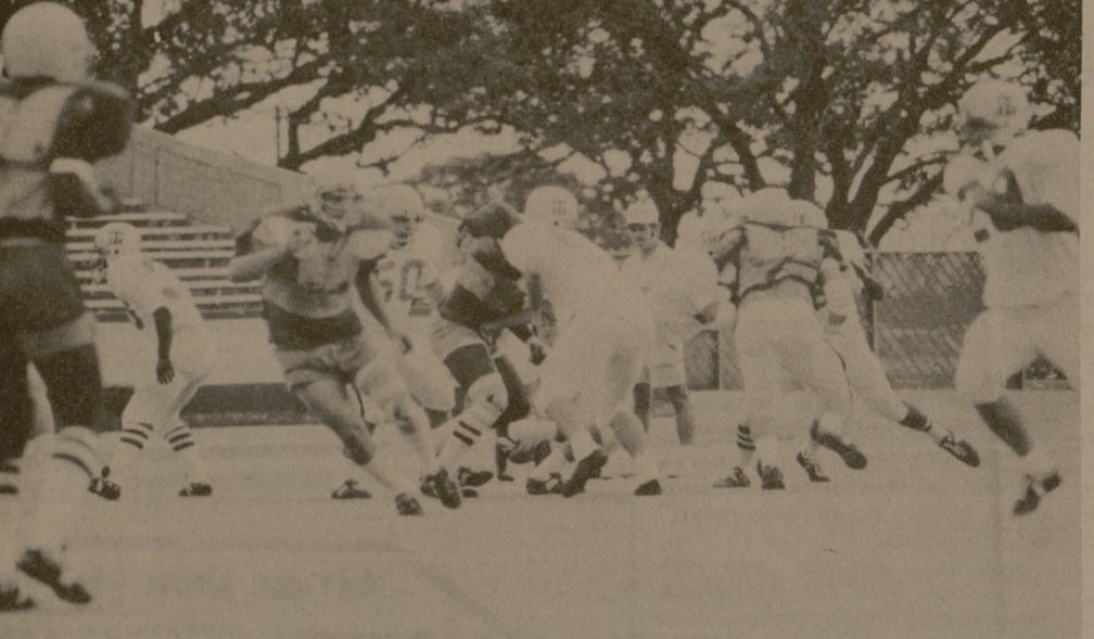
COND SCRIMMAGE PREPARATION—Aggie gridders run through game type situations sterday to prepare for Saturday's scrimmage at Kyle Field. Kickoff is 2 p.m.