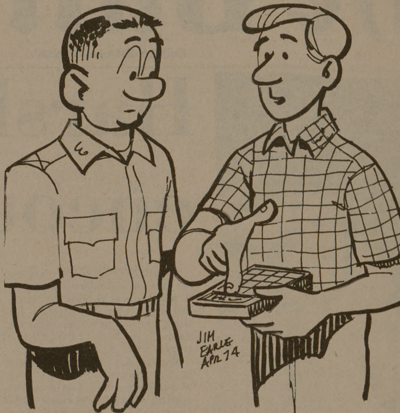
"A pocket calculator really doesn't help me solve problems. I just find out quicker that I can't solve them!"

school anywhere, even with its faults. Further, I don't intend to imply that there should be all civilian or Corps yell leaders. This university is made up of both and should be represented accordingly.