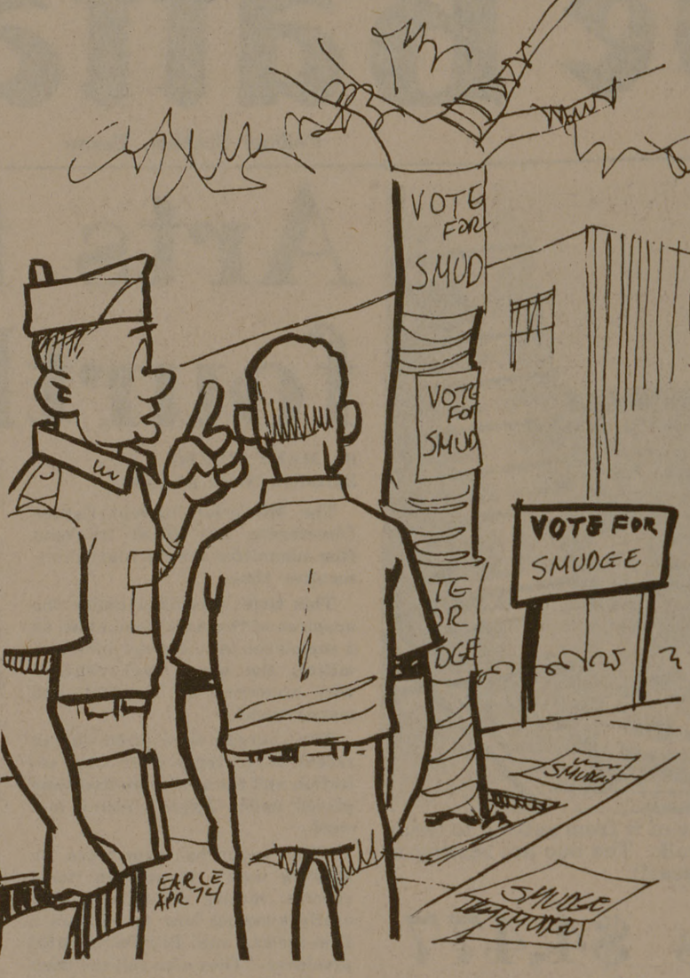
"I understand that he's strong for pollution control!"

who is their adviser. It's president is relatively unknown because the organization has not confronted anything. It's doubtful that its dorm suggestion? No, no, that's constituents even know a new