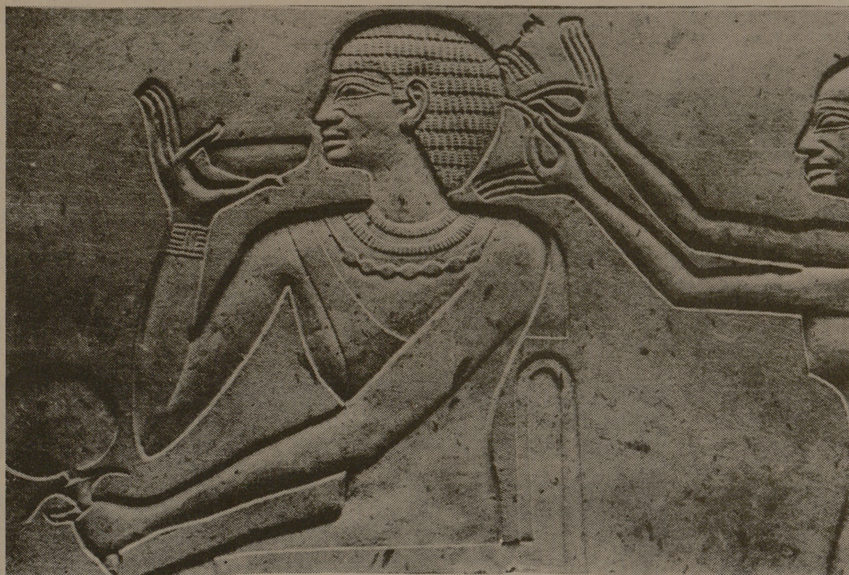
Smile and say cheeseburger.

Two Dallas locations: 3071 Northwest Hwy. 352-8570 2131 Ft. Worth Ave. 946-0645