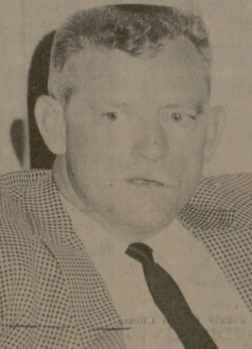
John David Crow

Others receiving votes, listed alphabetically: Arizona, Arizona State, Centenary, Florida State, Massachusetts, McNeese State, Nevada-Las Vegas, New Mexico, Purdue St. John's, N.Y., Southern Illinois, Syracuse, Utah, Wisconsin.