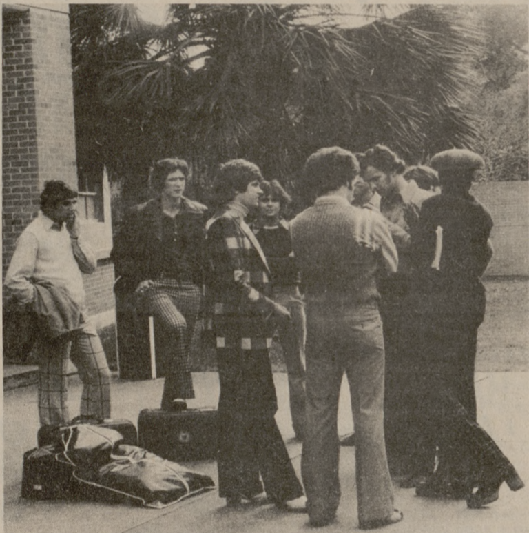
ON THE ROAD—A&M cagers prepare to leave for the basketball-conscious East and their first road game of the season. They meet Virginia Commonwealth tonight and then compete in the Marshall Tournament in West Virginia this weekend.

I was sure he was crazy until last week. After 13 months of golf, I broke 80 with what I thought was the most monumental 78 ever shot on any course, anywhere. The joy can never be recaptured, until I shoot my first 69.