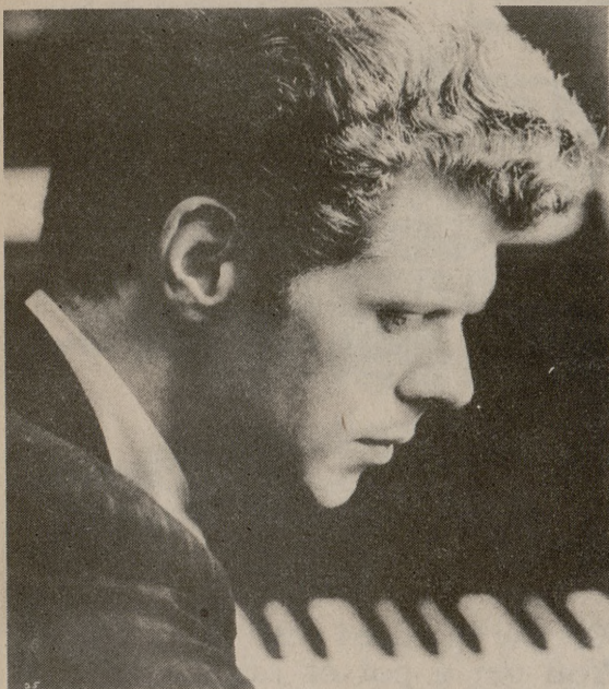
Van Cliburn Managed by Huron Concerts, Inc.

"There are gifted and great musicians today, but none is so beloved by his audience as Van Cliburn."