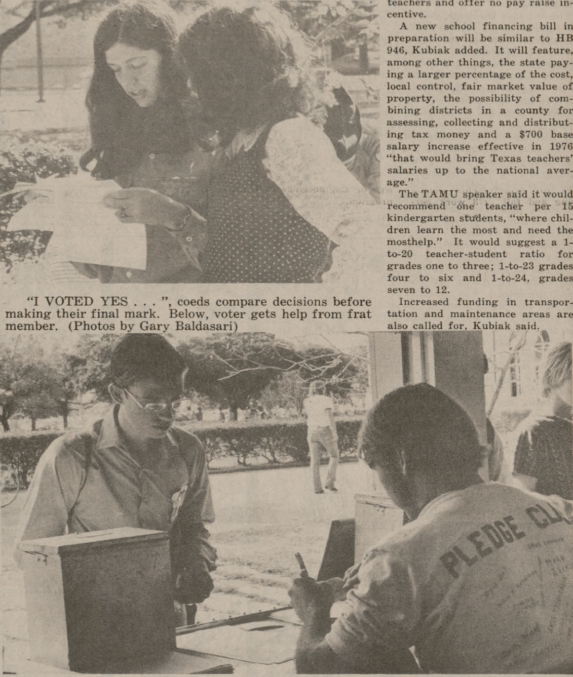
"I VOTED YES.." coeds compare decisions before making their final mark. Below, voter gets help from frat member.