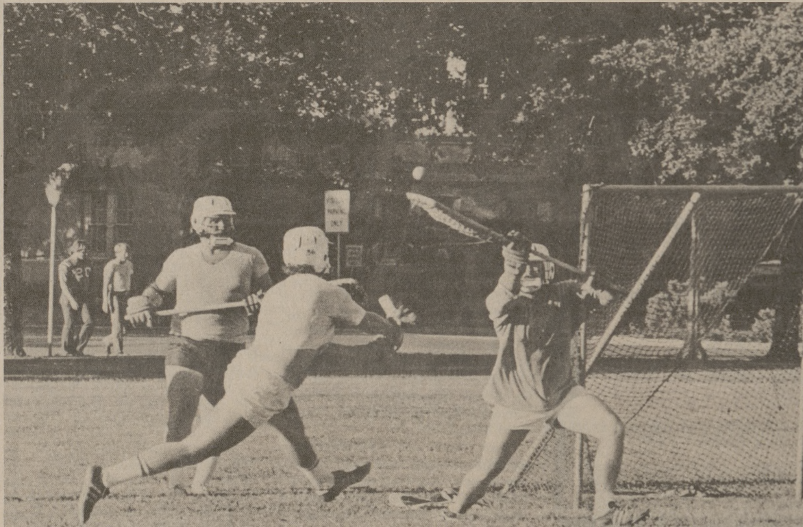
MEMBERS of the A&M Lacrosse Club scrap at close quarters for the rubber spheroid during an A&M practice session on the Drill Field. The team will play in an exhibition match before the Dallas Cowboys-New York Giants football game Sunday in Texas Stadium.