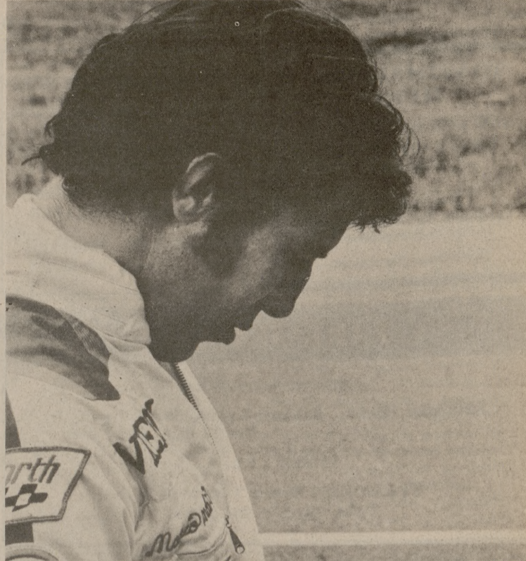
WORLD RECORD PERFORMER Mario Andretti studies notes after posting a new closed course speed mark of 214.158 MPH during trials for Saturday's Texas Twin 200.

The Aggies feel South Carolina is as good a place as any to find the elusive continuity.