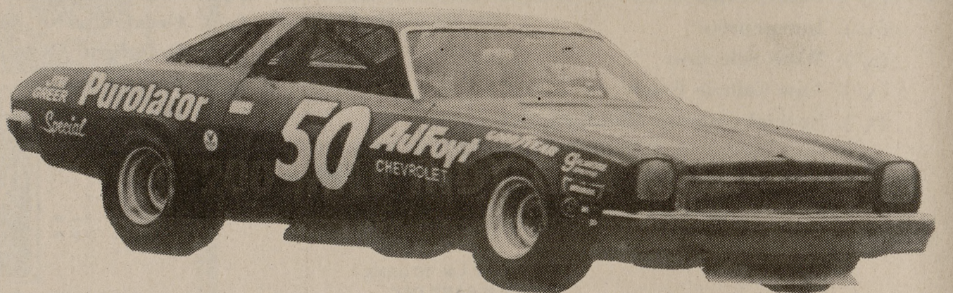
200 MILE USAC STOCK CAR RACE