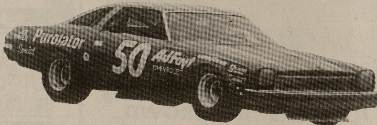
200 MILE USAC STOCK CAR RACE