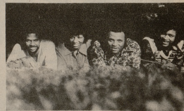
Andre Crouch and The Disciples

For Lodging (Cost $7.00) and Reservations Call B.S.U. at 846-6411