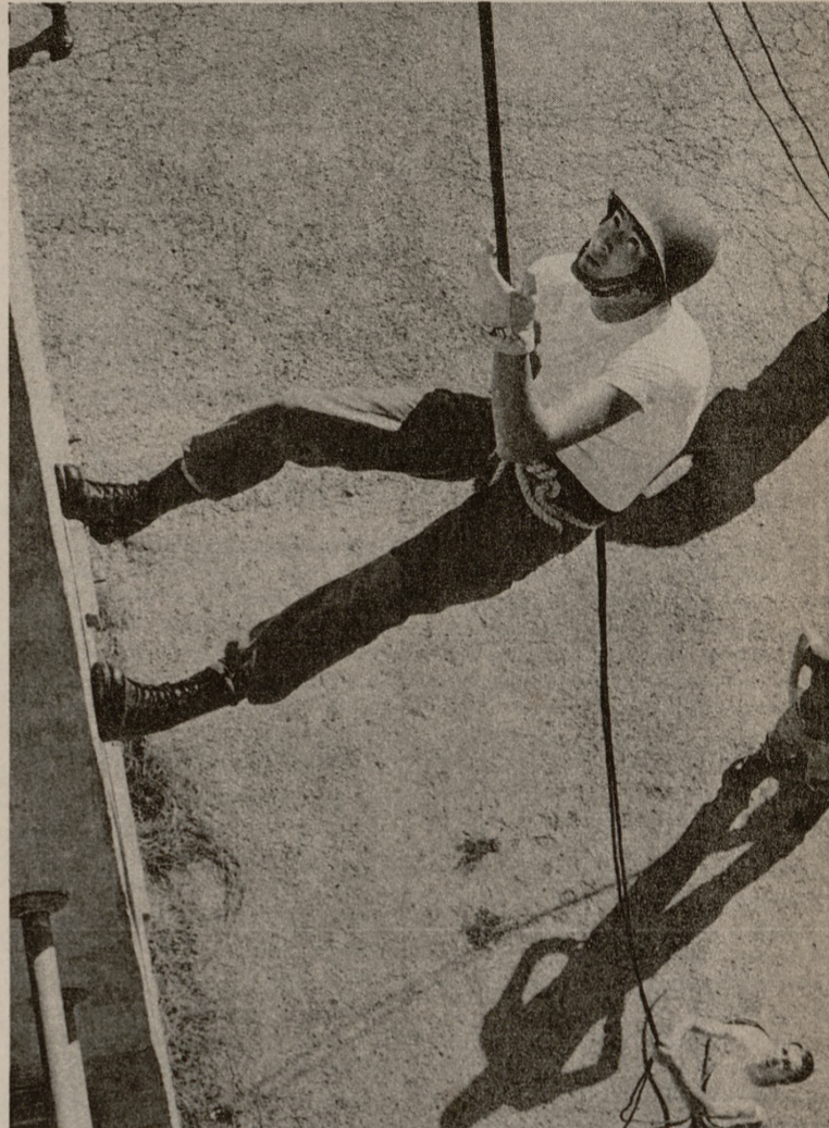
FINDING AN AIRPORT in a combat zone is not always an easy task. These Rangers are practicing in case they ever have to come out of a helicopter by means of a rope.