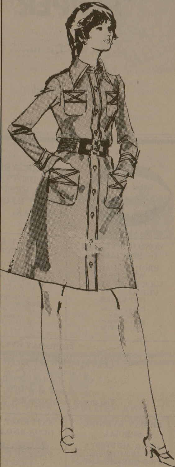
OUR "JR NARDIS" IS CORINTH STREET, FEATURING A PUTTY TRIM BLACK SHIRT DRESS OF POLY & RAYON-8-14.....$48.00