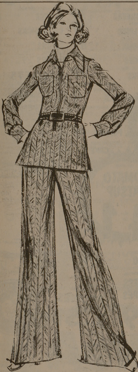
A SMASHING PANTSUIT OF RUST HERRINGBONE, 100 PERCENT POLYESTER DOUBLEKNIT-12-18.. $95.00

1907 TEXAS AVE. 823-0023 BRYAN, TEXAS 77801