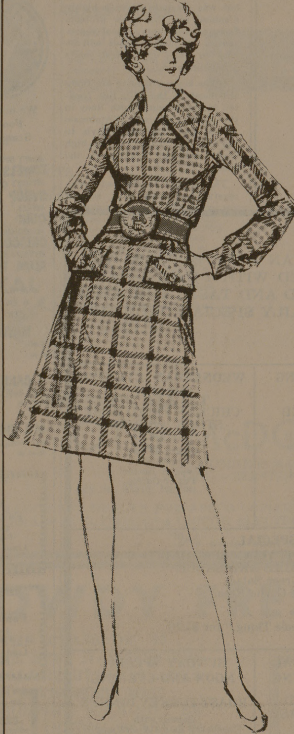
STEP FORWARD IN A RED-WHT-BLUE PLAID DOUBLEKNIT DRESS, CINCHED WITH BLUE LEATHER BELT WITH BRASS EAGLE-12-16.....$72.00