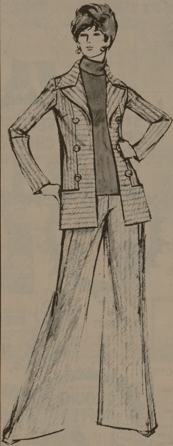
OUR GOLD TRI-TONE TWIST DOUBLEKNIT 3 PIECE PANTSUIT-14-20.....$115.00