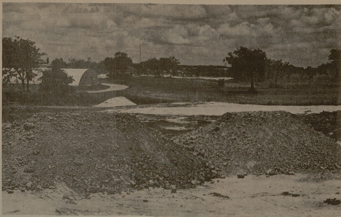
MOUNDS OF DIRT await spreading on the green of the 10th hole during the renovation of A&M's golf course.

In 1972 she was ranked No. 7 in the nation among junior girls by Golf U.S.A. magazine and finished second among junior girls at the USGA's Women's Open in Rochester, N.Y.