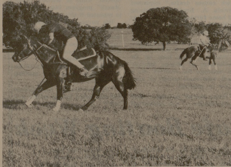
DIFFICULT LIE —That's not Lee Marvin falling off his horse but rather a member of the A&M polo team during a practice session. The polo season begins this fall.