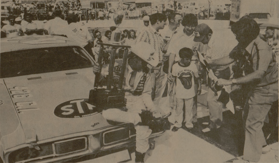
I'M GLAD IT'S OVER WITH—Richard Petty seems pleased to be out in some fresh air after spending over 3 hours in his 125-degree temperature car. His TWS Alamo 500 victory gained him $13,820 and 375 point toward the national NASCAR Winston Cup championship. The victory here was his third in five outings.

Notables such as A. J. Foyt, Gordon Johncock and the Unser brothers were not on hand as other commitments had been made in a NASCAR race held in Milwaukee. Bobby Unser won that event. All, however, will be on hand at Texas World Speedway when the final event of the season is run on November 6.