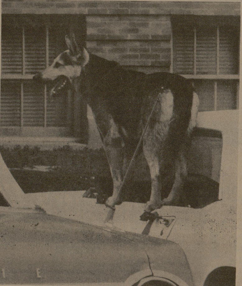
ARMED TO THE TEETH and full of courage for his master this lonely German Shepherd kept a solitary lookout for the return of his owner Monday afternoon. A light drizzle later forced his vigil to be continued inside the car he was leashed to.