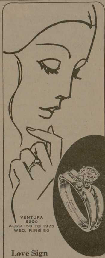
VENTURA $300 ALSO 150 TO 1975 WED. RING 50