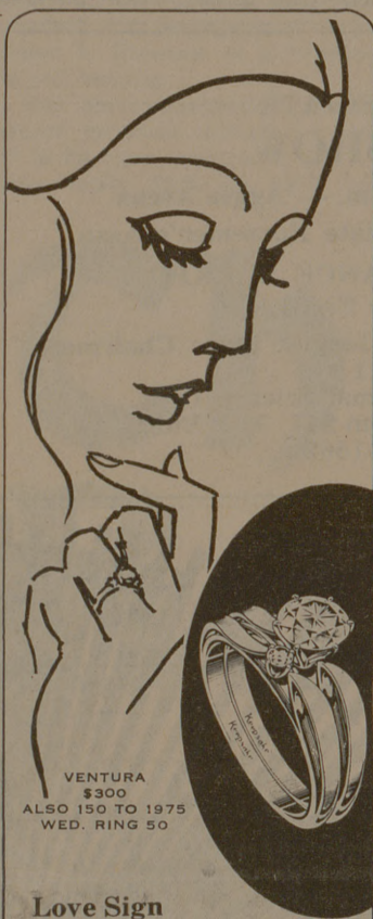
VENTURA $300 ALSO 150 TO 1975 WED. RING 50

Sales • Service • Accessories 3505 E. 29th St. — 822-2228 — Closed Monday Take East University to 29th St. (Tarrow Street)