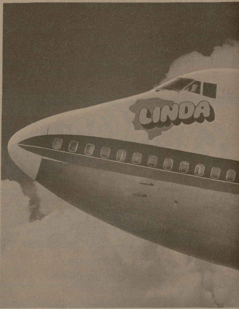
Daily 747 Service from Miami to London starts May 1.

1 Effective April 15 thru May 31 2 Effective June, July, August. 3 Effective April 15 subject to governments' approval.