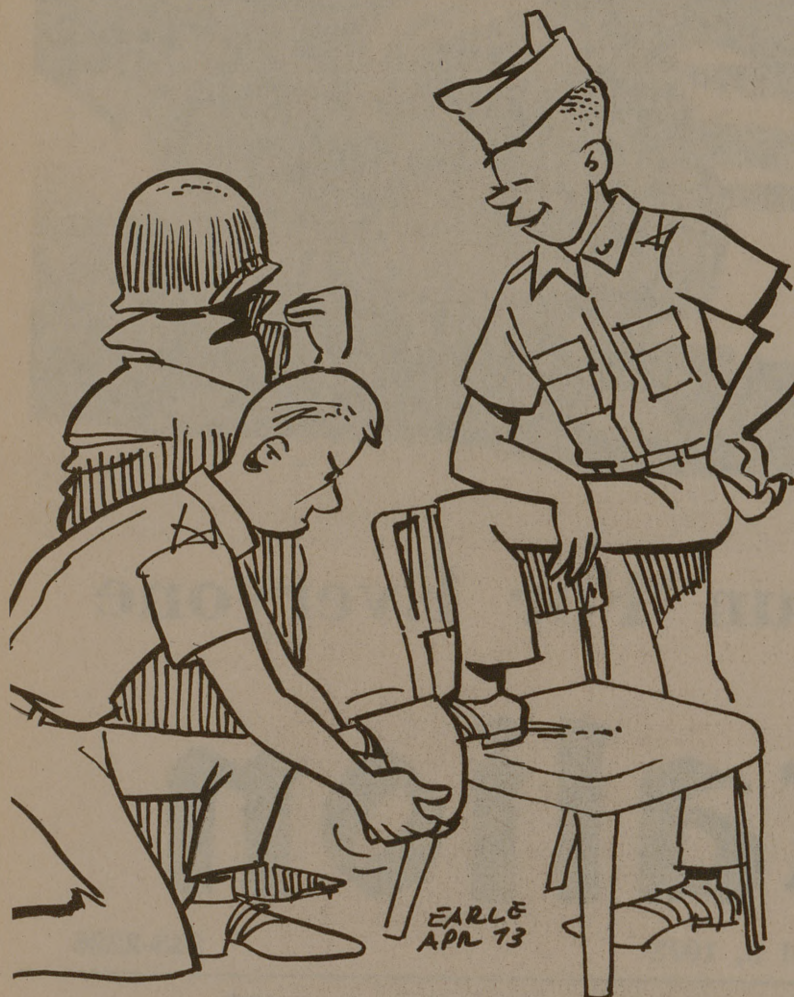
"Wouldn't Fish Day be great if we have access to our profs in addition to our sophomores?"