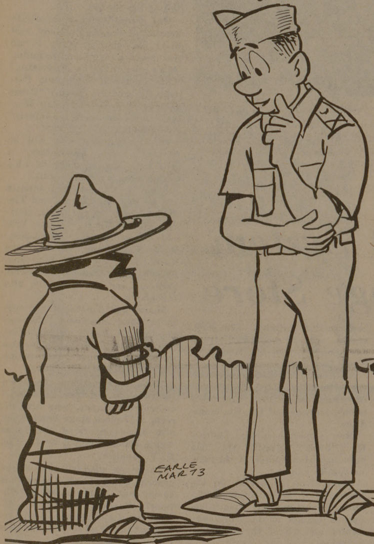
"It may make you look more distinguished than a helmet, but not taller!"