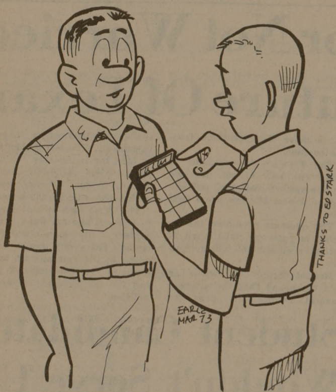
"I'll admit that those pocket calculators are cute, but what's going to happen when the profs learn you can work twice as many homework problems and quiz problems?"