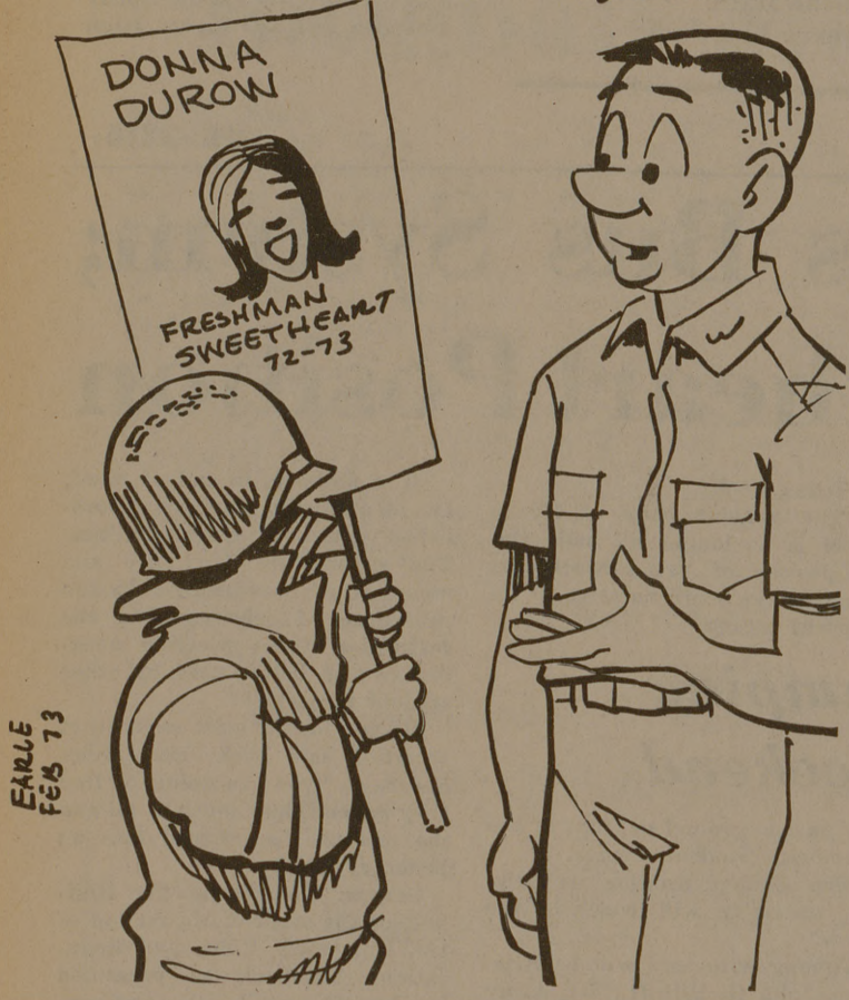
"Not only does the freshman class have the prettiest sweethearts, but you're the only class that still has sweethearts!"