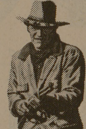
THE TRAIN ROBBERS